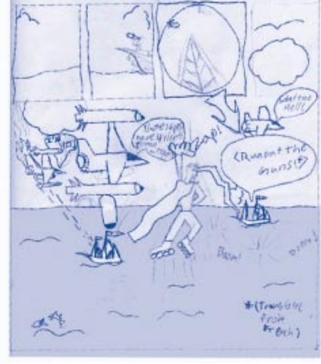
Sal's Electro Magnetic Man

Effective literacy instruction for adolescents acknowledges that all uses of written language (e.g., studying a biology text, interpreting an online weather map, and reading an Appalachian Trail guide) occur in specific places and times as part of broader societal practices (e.g., formal schooling, searching the Internet, and hik-