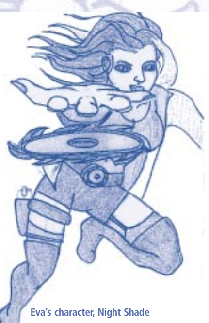
Through their characters, these young people try on new identities, playing with different subject positions.

boundaries and of experimentation often appear in young people's art, especially in afterschool settings where youth have the freedom to create works of their own choosing.